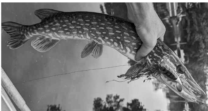
Aaron Ronning caught this 26 inch pike in the east channel on July 2, 2023.

School Section Lake continues to be one of the purest lakes in the area. You can help us continue to keep the lake healthy by using phosphorus free fertilizers, avoiding gasoline spills and by preventing leaves and lawn clippings from going into the lake. The lake is completely spring fed, with no inlet of a stream or river and only an outlet that runs when lake level is high. Let's all do our part!